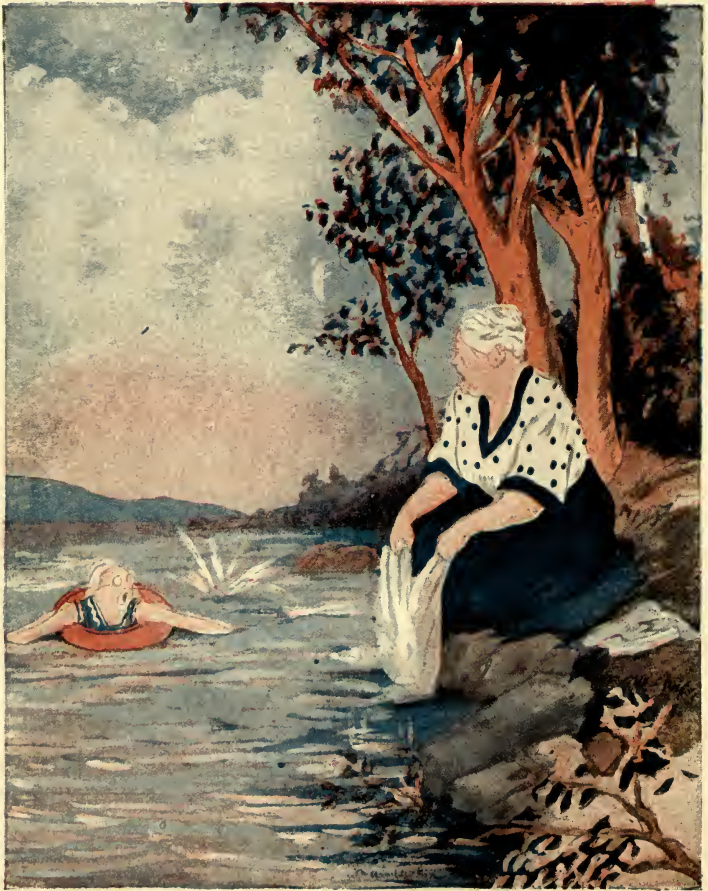
“GET THE CANOE AND FOLLOW. I’M HEADING FOR ISLAND ELEVEN ”